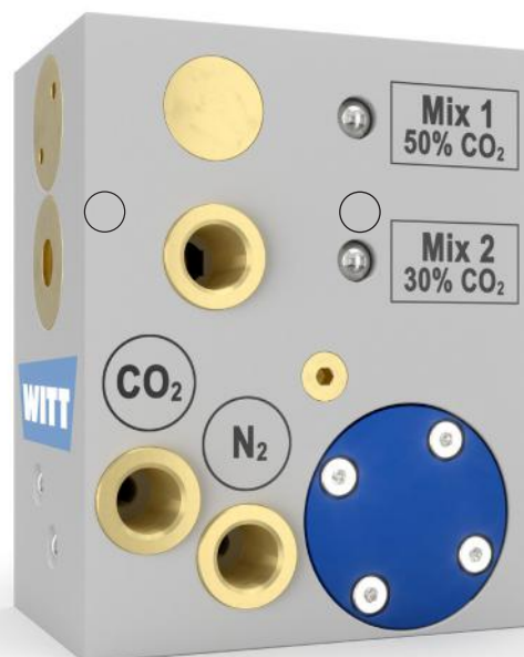
KM 20-2 ECO